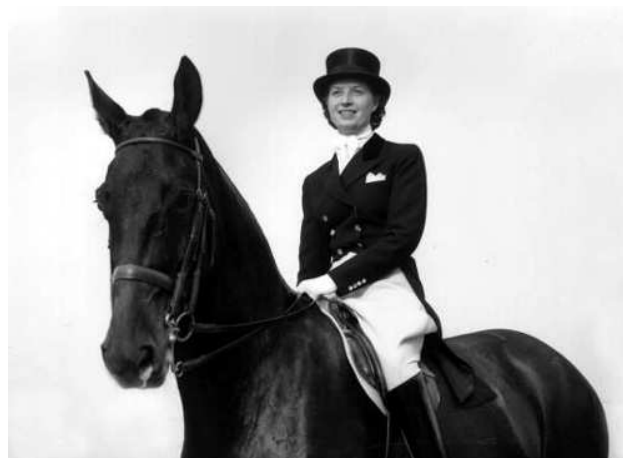
Lis Hartel riding Jubilee, who she won the 1952 and 1956 Olympics on.

Noticing the impact that horse back riding had on disabled individuals, the U.S. and Canada also started their own therapeutic Riding centers. The first was "Community Association of Riding for the Disabled" (CARD) in Toronto, Ontario and "Cheff Center for the Handicapped" in Augusta, Michigan. In November of 1969, about 20 individuals came together in Middleberg, VA. and started brain storming ideas for an official therapeutic riding organization this organization became known as the North American Riding for the Handicapped or NARHA. Since the organization in 1966, NARHA has more then 800 centers throughout North American and Canada and accommodates more then 42,000 people with special needs.